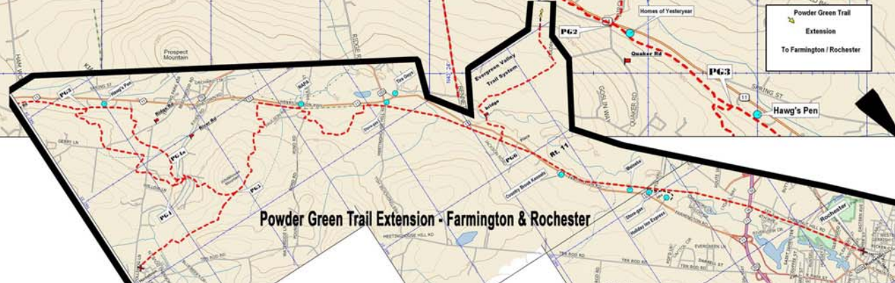
Powder Green Trail Extension - Farmington & Rochester